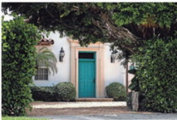
In Midtown, mature trees frame the motor court and front door at 160 Barton Ave., which was just listed at $32.8 million.