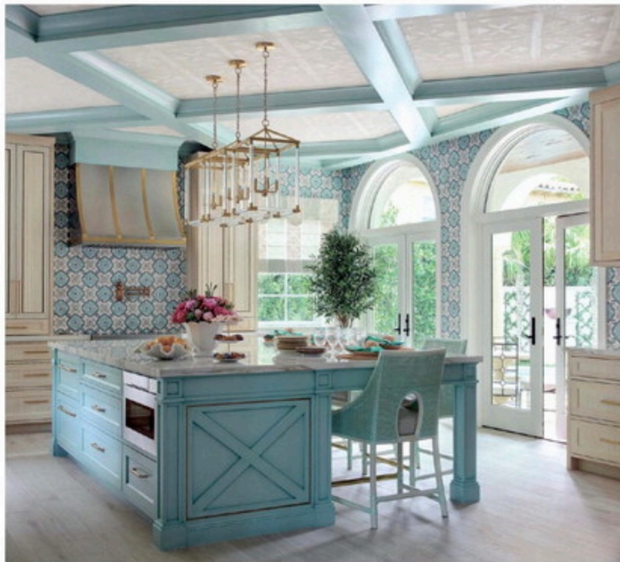
Alexandra Naranjo used custom-painted tile backsplash and cool seafoam blue to update this kitchen in a Palm Beach home.